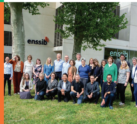
LIBER Emerging Leaders Programme 2022 in Lyon, France)